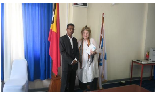
Minister of Education, Timor Leste