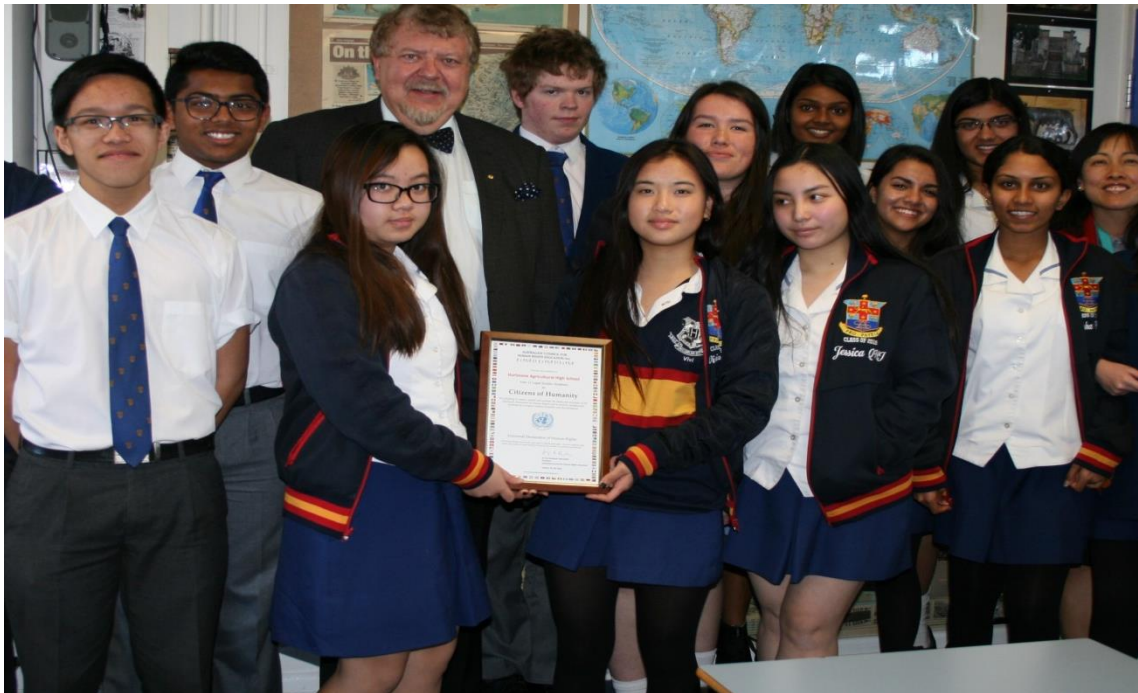
Year 12 students at the Hurlstone Agricultural High School