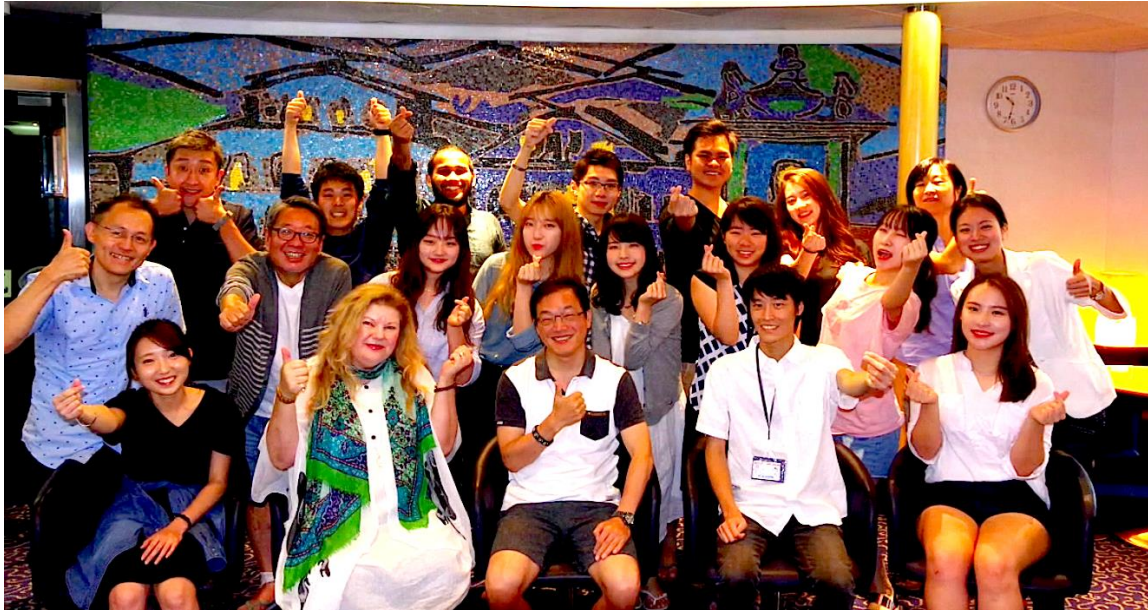
Staff, guest educators and students at Peace Boat Global University (Japan) in August 2016.