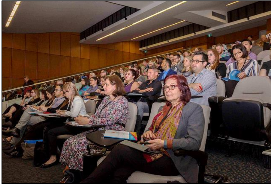
Conference delegates at a plenary session