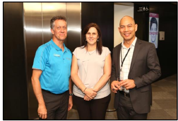
Members of the Organising Team