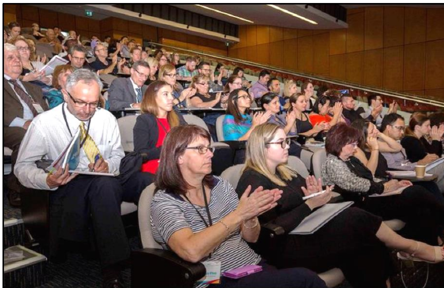
Conference delegates at a plenary session